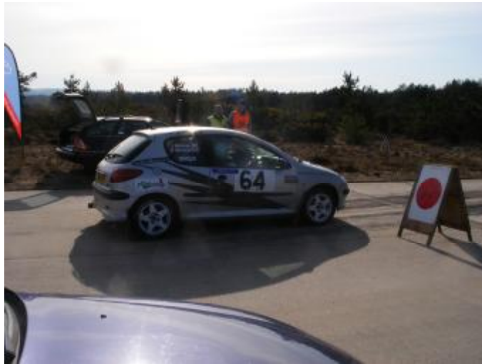
Jimmy & Russell at Bovington on 23 March