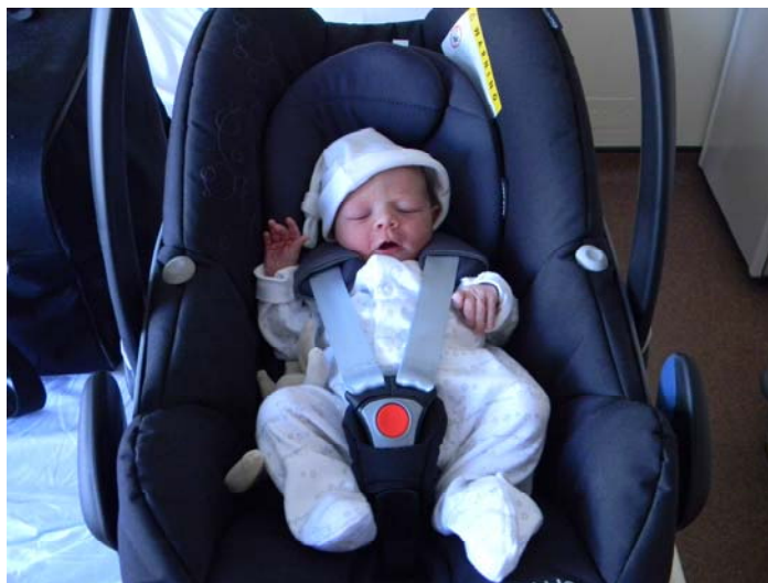
Getting her used to a 3 point Harness early!